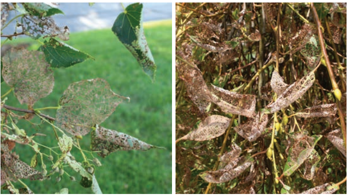
Figures 11 and 12. Japanese beetle adult feeding damage on littleleaf linden leaves (left) and pussy willow (right).

Population management should begin after larvae emerge from eggs when they are small and near the soil surface. A number of soil-applied insecticides are available for managing Japanese beetle larval populations. Many products should be applied four weeks before larvae emerge from eggs to ensure insecticide residues are present in the soil when larvae are small. Larger larvae can be difficult to kill with most soil-applied insecticides, thus requiring treatment with trichlorfon (Dylox). Soil-applied insecticides become less effective as larvae migrate deeper into the soil to overwinter.