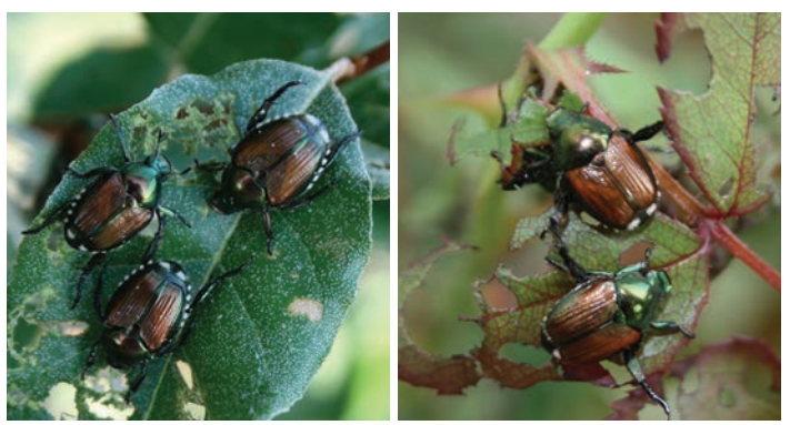
Figures 2 and 3. Japanese beetle adults feeding on viburnum leaf (left) and rose leaves (right).