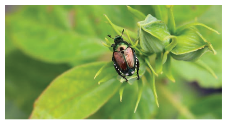
Figure 4. Japanese beetle adult with five white tufts of hair on each side of the abdomen and two on the end of the body.

In approximately two weeks, the white, C-shaped, <sup>1</sup>/<sub>16</sub>-inch (2 mm) long larva emerges (ecloses) from the egg and progresses through three larval stages (instars) before reaching maturity. The third-instar larva, which are 1 to 1½ inches (25 to 28 mm) long (Figure 5), causes the most