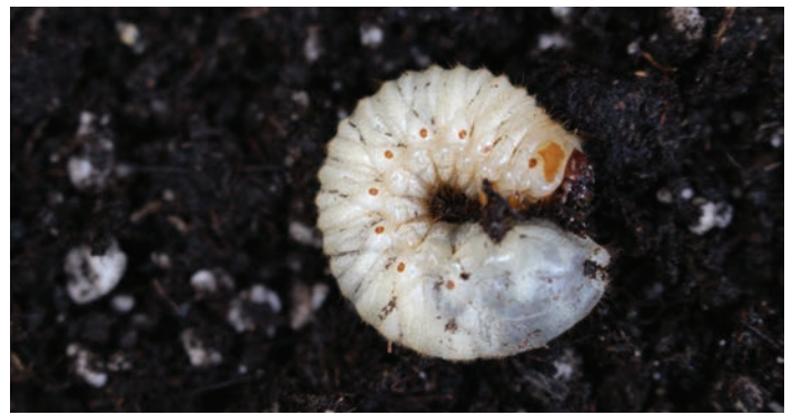
Figure 5. Japanese beetle third-instar larva or grub.

Japanese beetle larvae have a distinct rastral (setae) pattern on the end of the last abdominal segment consisting of two rows of short spines in a V-shape surrounded by a random arrangement of spines (Figure 6). When the soil is moist early in the summer, larvae are located near the soil surface. However, as soil dries, larvae migrate deeper into the soil. They eventually move upward and resume feeding when the soil is moist. In late fall, larvae migrate down deeper into the soil when soil temperatures are below 60°F (15°C). As soil temperatures increase in the spring, larvae move closer to the surface and begin feeding on the roots of turfgrass and other plants. In late spring, larvae create a cavity