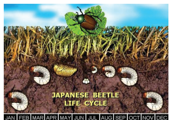
Figure 1. Japanese beetle life cycle.

Japanese beetle, Popillia japonica Newman, is native to Japan and was first reported in the United States in 1916 in Riverton, New Jersey. Japanese beetle is present from Maine to Georgia and has become established in nearly every state east of the Mississippi River as well as many states west of the Mississippi River. The adult is one of the most destructive insect pests of horticultural plants in landscapes, nurseries, fruit tree orchards, and vegetable gardens. The larva or grub stage is a major insect pest of home lawns, golf courses, athletic fields, recreational and industrial turfgrass, and sod farms. This publication focuses on the biology, behavior and chemicals, and damage caused by Japanese beetle adults and larvae. The information is intended to help homeowners and turfgrass professionals manage Japanese beetle populations.