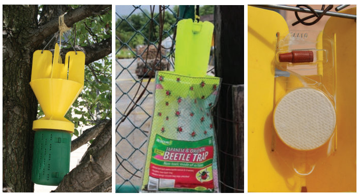
Figure 13. Japanese beetle adult traps (left and center). Figure 14. Floral food lure (bottom right) and synthetically-derived sex pheromone (top right).