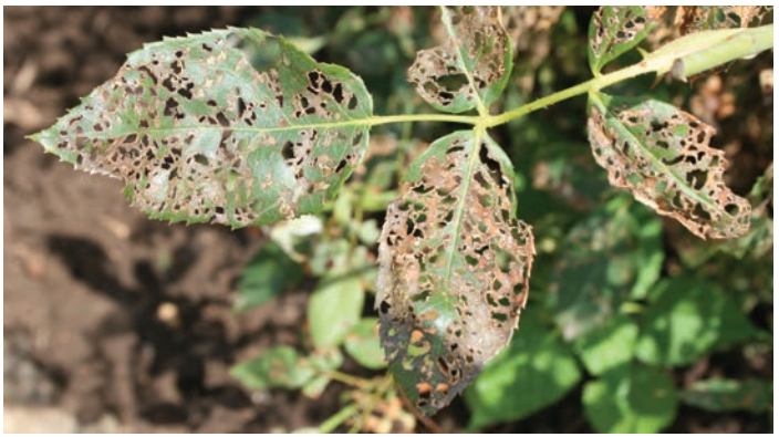
Figure 10. Japanese beetle adult feeding damage on rose leaf.