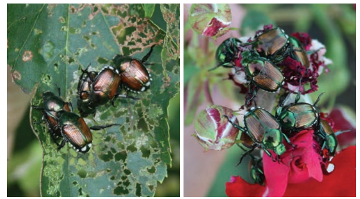
Figures 8 and 9. Japanese beetle adults feeding on linden leaf (left) and rose flower (right).

Japanese beetle adults feed on more than 300 plants. These include rose, linden, crabapple, willow, Virginia creeper, purpleleaf plum, Norway maple, and American elm. Table 1 lists the ornamental plants that are susceptible to Japanese beetle adults. Adult beetles congregate on leaves and flowers (Figures 8 and 9) and mainly feed on the upper leaf surface, creating irregularly shaped holes (Figure 10). On highly susceptible plants, Japanese beetle adults will feed on the leaf tissue between the veins, which results in