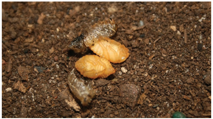
Figure 7. Japanese beetle pupae.

in the soil where they pupate (Figure 7). In about two weeks, the pupae become adults and emerge from the soil. Japanese beetle overwinters as a third-instar larva located about 2 to 8 inches beneath the soil surface, depending on the soil type. There is one generation per year.