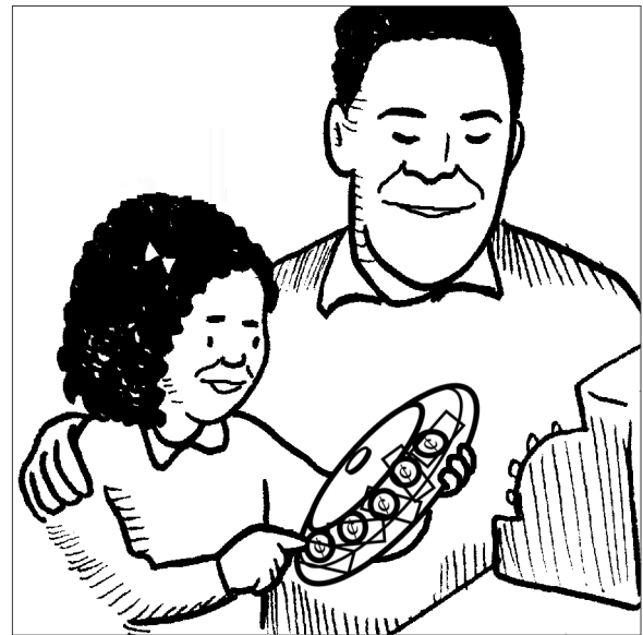
Decide how many pennies each item costs.

Step 1: Explain what you will be doing together (read through entire activity before you begin)