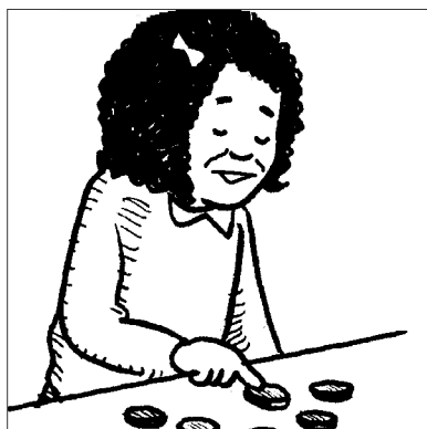
Your child “buys” items by matching pennies.

The two of you will set up a make-believe store. Your child will be able to pretend to buy and sell items at the play store.