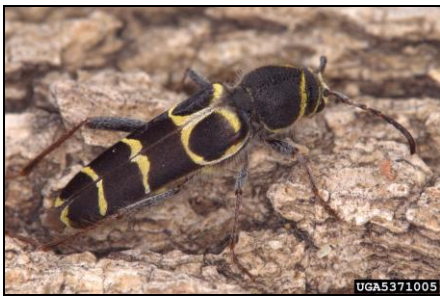
Banded Ash Borer