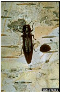
Bronze Birch Borer