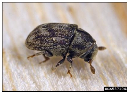
Eastern Ash Bark Beetle