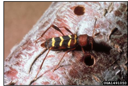
Red Headed Ash Borer