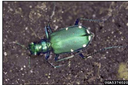
Six-spotted Tiger Beetle