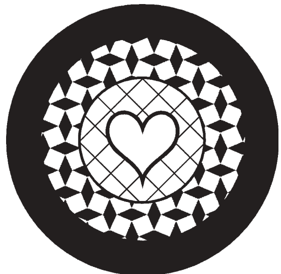
Target of Life

P ut yourself in the center of the heart of the Target of Life. Notice that the heart of the Target is clear, unobstructed, full of light. From there, you see clearly and make choices that are good for you and those around you. You are attuned to your inner guidance and best judgment. You feel at peace, strong, compassionate, joyful, energetic, and creative. Your reflexes are sharp, your immune system strong. You stumble and fall less often, and you handle life's inevitable challenges with more confidence and skill. Your ability to endure prolonged hardship increases. You are naturally more sensitive to others—more patient, generous, and understanding. You more easily express the richness of your authentic self. The more deeply centered you are in the heart of the Target of Life, the more love you feel and share. You are at your best—physically, mentally, and spiritually.