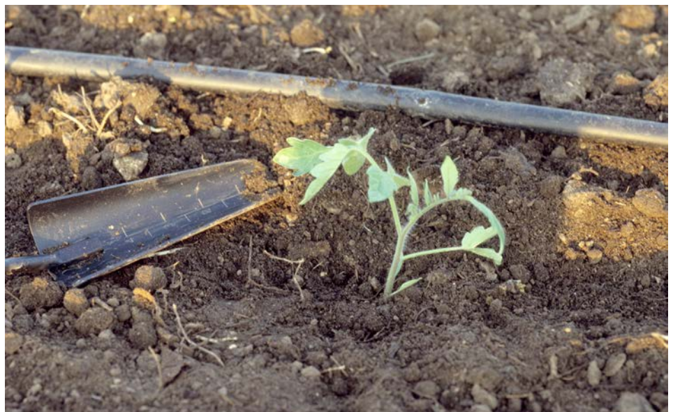
Set tomato plants mostly below the soil surface and cover to the first set of leaves.

Ask your local extension agent for specific recommendations on fertilizing tomatoes. If you choose not to do a soil test, add 1 to 2 pounds of complete